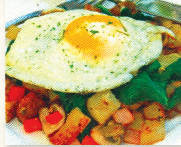
Gyro Skillet <sup>$</sup>8.95 Meat Lovers Skillet <sup>$</sup>9.50 Veggie Skillet <sup>$</sup>7.75 All skillets come with toast or pancakes